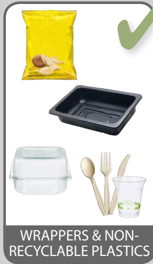
WRAPPERS & NON- RECYCLABLE PLASTICS