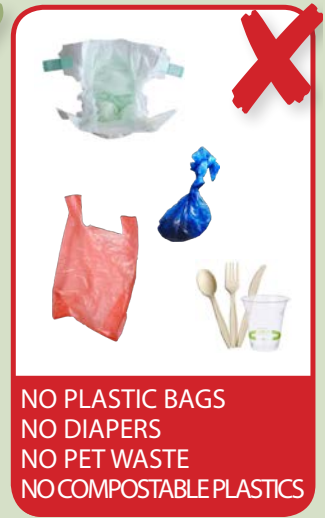
NO PLASTIC BAGS NO DIAPERS NO PET WASTE NO COMPOSTABLE PLASTICS