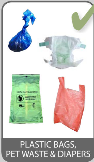
PLASTIC BAGS, PET WASTE & DIAPERS