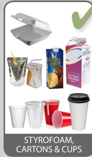
STYROFOAM, CARTONS & CUPS