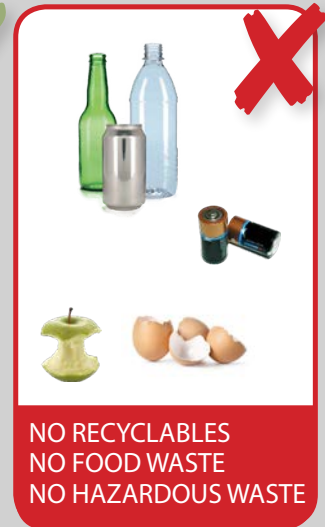
NO RECYCLABLES NO FOOD WASTE NO HAZARDOUS WASTE